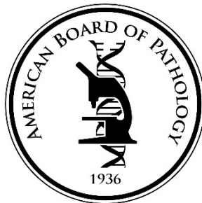
The ABPath LOGO

The logo of the American Board of Pathology depicts the origin and evolution of pathology. The traditional microscope in the foreground symbolizes cellular pathology and laboratory medicine. In the background, the double helix reflects the evolving discipline in the molecular era.