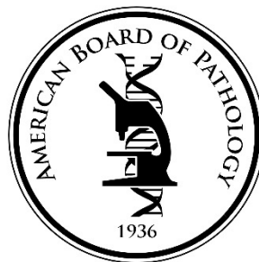
The ABPath LOGO

The logo of the American Board of Pathology depicts the origin and evolution of pathology. The traditional microscope in the foreground symbolizes cellular pathology and laboratory medicine. In the background, the double helix reflects the evolving discipline in the molecular era.